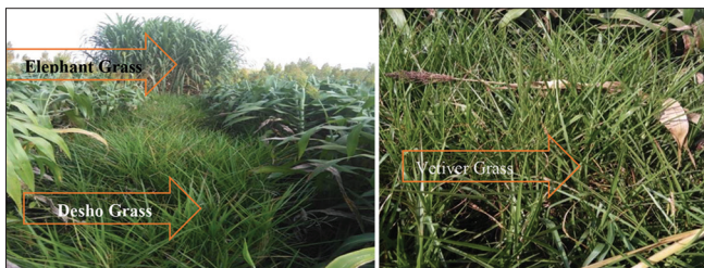
Figure 2: The status of each grass species on the field

best potential of vetiver and desho grasses for soil and water conservation. [2,4,5,15] Reported that land treatment with vegetation lowers erosion rates and removes fine particles with surface runoff.